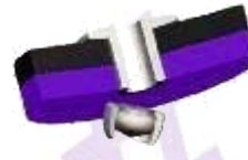
Sheared Secondary Head