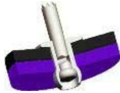
High Mandrel Break